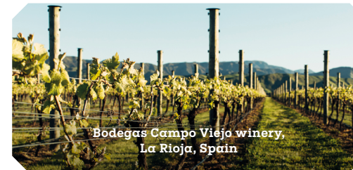
Bodegas Campo Viejo winery, La Rioja, Spain

O ur Campo Viejo winery in Spain has used a variety of tactics to reduce and offset its greenhouse gas emissions. The winery also prioritizes the biodiversity of the region by protecting and nurturing it to ensure it thrives.